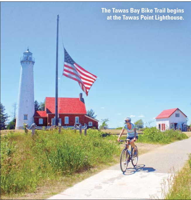
The Tawas Bay Bike Trail begins at the Tawas Point Lighthouse.